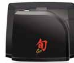
ELECTRIC SHARPENER Includes dust cover AP0119 8 7 / 8 "