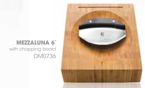
MEZZALUNA 6" with chopping board DM0736