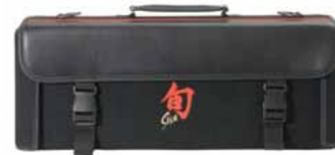
CHEF'S 17-SLOT KNIFE CASE DM0881 Unfolded 35 1 / 2 " x 20" Folded 8 1 / 2 " x 3 1 / 2 " x 3 3 / 4 "