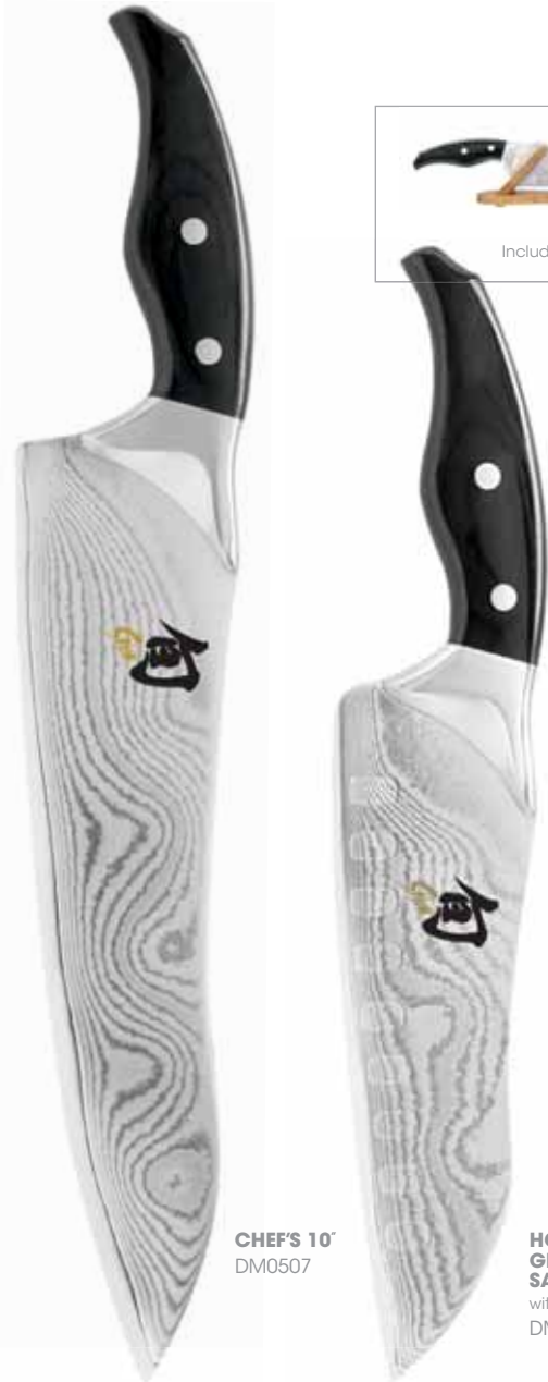
CHEF'S 10" DM0507