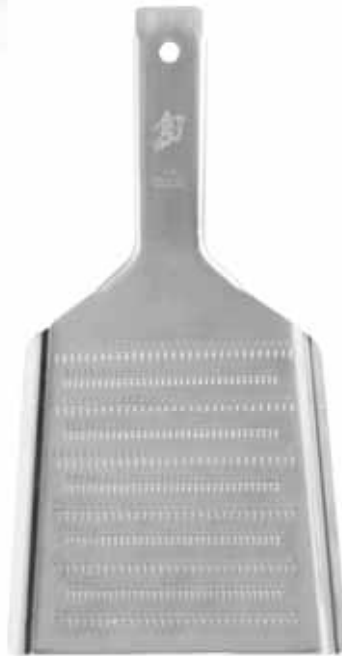
TRADITIONAL GRATER DM0900 10 3 / 4 " x 5 1 / 2 "