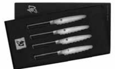
CLASSIC 4 PC ULTIMATE STEAK KNIFE SET DMS0420 | Four Ultimate Steak knives (DM0751) with serrated edge in a gift boxed set

Shun Classic's tasteful and contemporary designs feature beautiful Damascus-clad blades and D-shaped ebony PakkaWood® handles. Behind the knives' beauty is function: razor-sharp blades offering the most extreme performance possible. Shun's VG10 steel, known for its incredible edge retention, is clad with Damascus stainless steel, then bead-blasted, revealing a woodgrain pattern that allows the blade to slide easily through food. The result is knives that are sharp, durable, and corrosion resistant, as well as beautiful to behold. The Shun Classic line offers the widest assortment of both traditional blade shapes and cutting edge designs, so you can always find the right knife for the task.