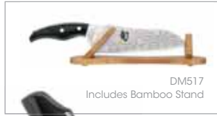
DM0517 Includes Bamboo Stand