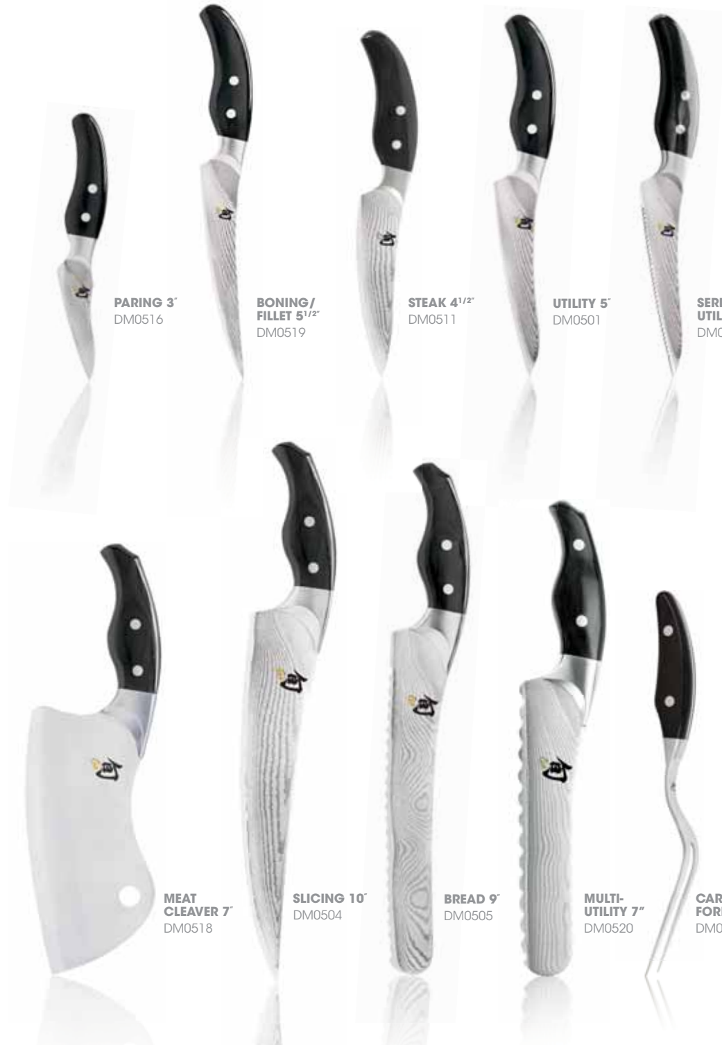
PARING 3" DM0516