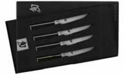
CLASSIC 4 PC STEAK KNIFE SET DMS400 | Four Steak knives (DM0711) in a gift boxed set