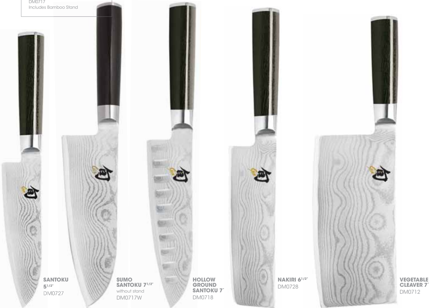
SANTOKU 5 1/2" DM0727