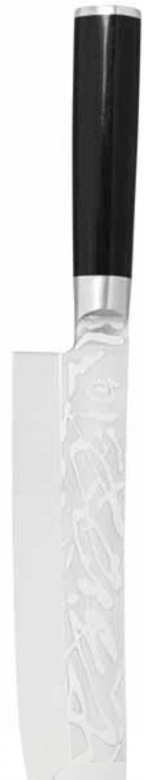
USUBA 6 1/2" VG0007