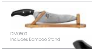
DM0500 Includes Bamboo Stand

VG10 cutting core (60 - 62 Rockwell Hardness Scale) Pattern Damascus clad with 16 layers of SUS410/SUS431 stainless each side 16° convex ground "extreme edges" Ergonomic PakkaWood® handles Arched blade & curved handle are comfortable for users of any height or dexterity