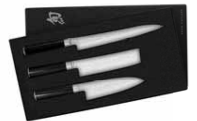
SHUN PRO ASIAN CHEF'S SET VGS0300 | Deba 6 1/2", Usuba 6 1/2" and Yanagiba 9 1/2" in a gift boxed set

For the true Japanese cuisine aficionado, nothing compares to the scalpel-like precision of a single-bevel blade. The newly updated Shun Pro line features the same incredibly sharp chisel edges as in the past and Shun's D-shaped PakkaWood® handles, which lend a secure and comfortable grip. The beautiful graffiti-etched blade is made with high-carbon VG10 steel, which takes and holds an edge longer than other premium steels. The blade backs are gently hollow ground, creating an air pocket between the knife and the food being cut, so the knife glides through food with quick precision. The wide shinogi (or blade bevel) makes sharpening these knives on a whetstone practically effortless.