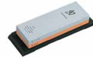
COMBINATION WHETSTONE 300 Grit/1000 Grit DM0708