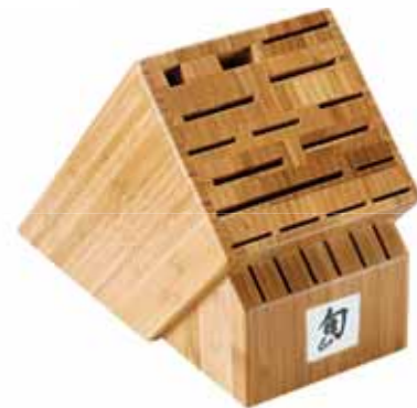
22-SLOT BAMBOO BLOCK DM0832