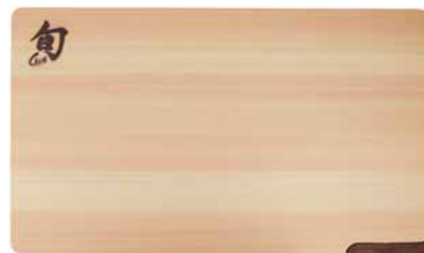
HINOKI CUTTING BOARD DM0806 15 1/2" x 9 1/2" x 1/2"