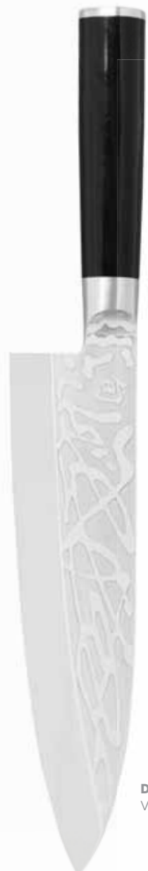
DEBA 8 1/4" VG0003