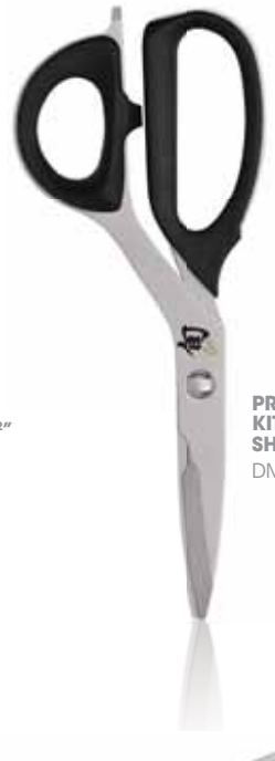
PREMIUM KITCHEN SHEARS 9" DM7240