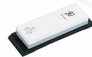
COMBINATION WHETSTONE 1000 Grit/6000 Grit DM0600