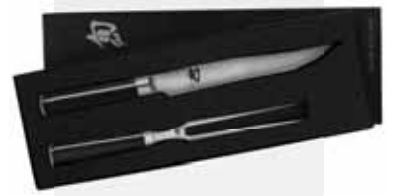
CLASSIC 2 PC CARVING SET DMS200 | Carving knife 8" and Carving Fork 6 1/2" in a gift boxed set