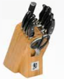
KEN ONION 11 PC DELUXE BLOCK SET KOS1100 | Paring 3", Chef's 4", Serrated Utility 5", Boning/Fillet 5", Chef's 6", Hollow Ground Santoku 7", Chef's 8", Bread 9", Honing Steel, Kitchen Shears and 10-slot Bamboo Block