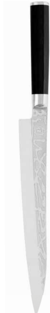
YANAGIBA 9 1/2" VG0005