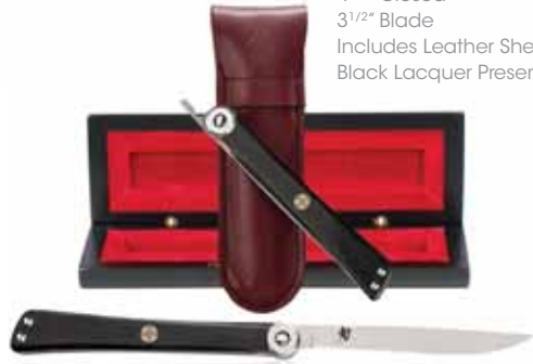
HIGO NOKAMI PERSONAL STEAK KNIFE DM5900 4 3 / 4 " Closed 3 1 / 2 " Blade Includes Leather Sheath & Black Lacquer Presentation Case

Shun accessories offer the perfect quality accents for your Shun knives. From accessories to maintain Shun's "extreme edges," to a variety of convenient storage systems, to specialty kitchen tools, accessorize with Shun and you'll always be chic.