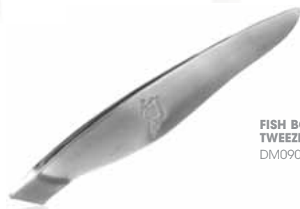
FISH BONE TWEEZERS 5 1 / 2 " DM0901