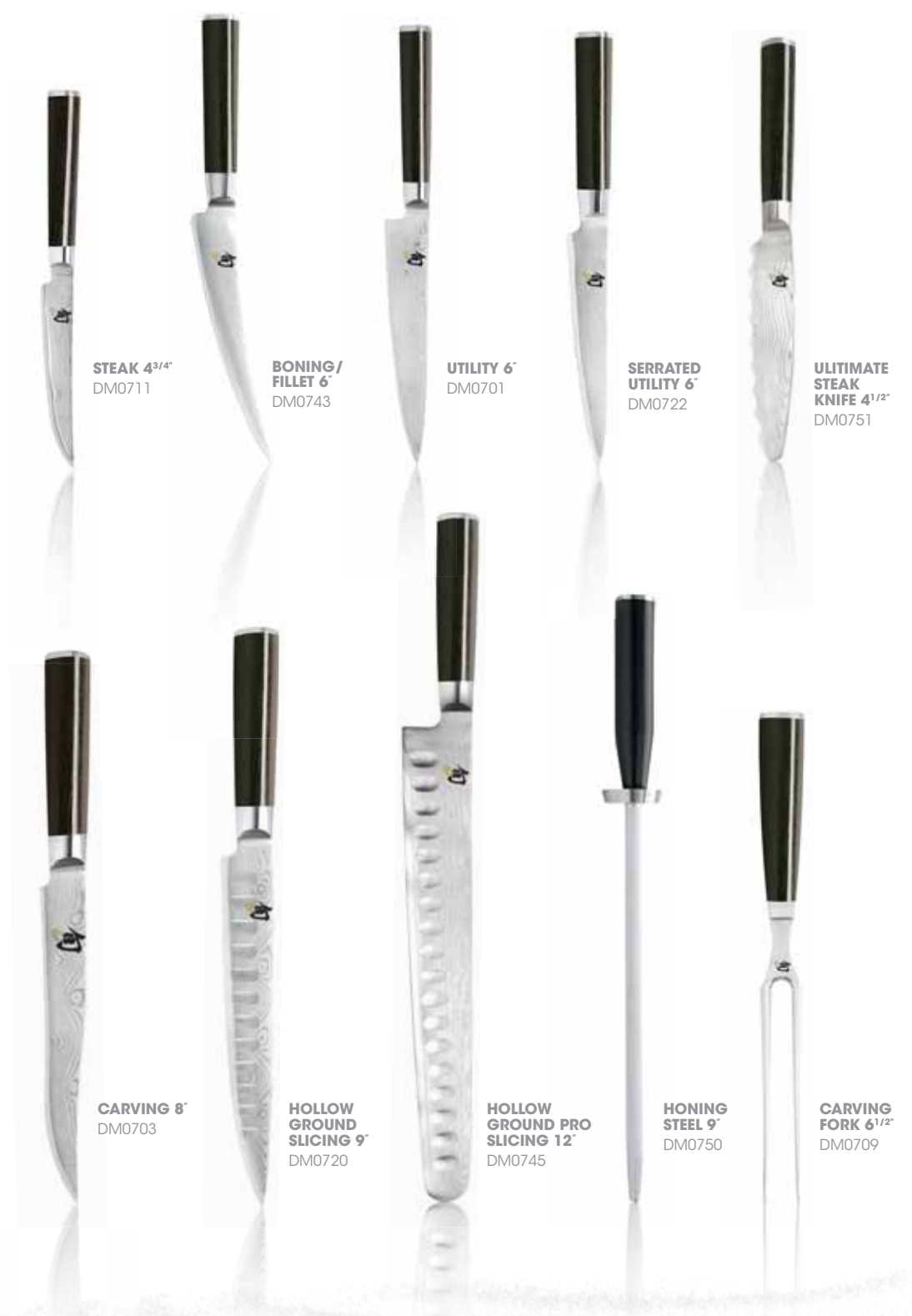
STEAK 4 3/4" DM0711