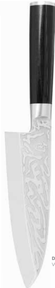
DEBA 6 1/2" VG0002