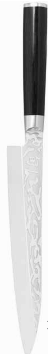
YANAGIBA 8 1/4" VG0004