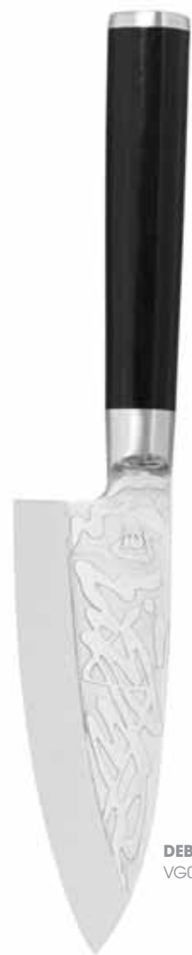
DEBA 4 1/4" VG0001

Solid VG10 blades (60 - 62 Rockwell Hardness Scale) Single-bevel 16° edges D-shaped PakkaWood® handles Traditional Japanese blade shapes Beautiful graffiti-etched blade