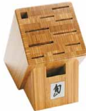
11-SLOT BAMBOO BLOCK DM0831