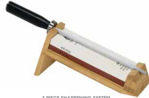
3-PIECE SHARPENING SYSTEM Includes combination 1000/6000 whetstone, honing steel and 16° angled stand DM0610