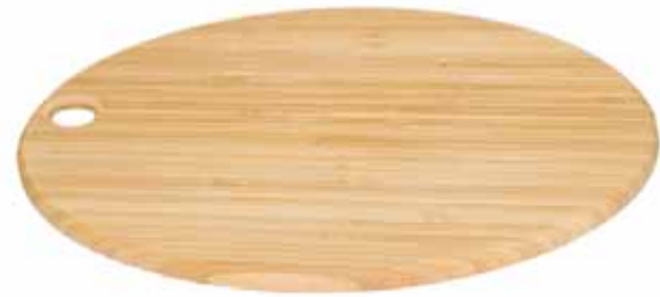
OVAL BAMBOO CUTTING BOARD DM0852 14" x 9" x 3/8"

Whether you opt for the ecological bamboo cutting board or the incredibly blade-friendly Japanese hinoki cypress board, you can rest assured knowing you are working on a naturally anti-bacterial surface. When storing your knives, a variety of bamboo options keeps your blades (and fingers) safe, whether using a countertop block, magnetic storage disks, or the new in-drawer knife tray. Shun knives deserve the care of Shun boards and blocks.