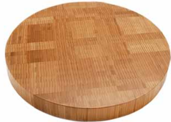
ROUND BAMBOO CUTTING BOARD DM0810 14" Dia. x 1 1/2"