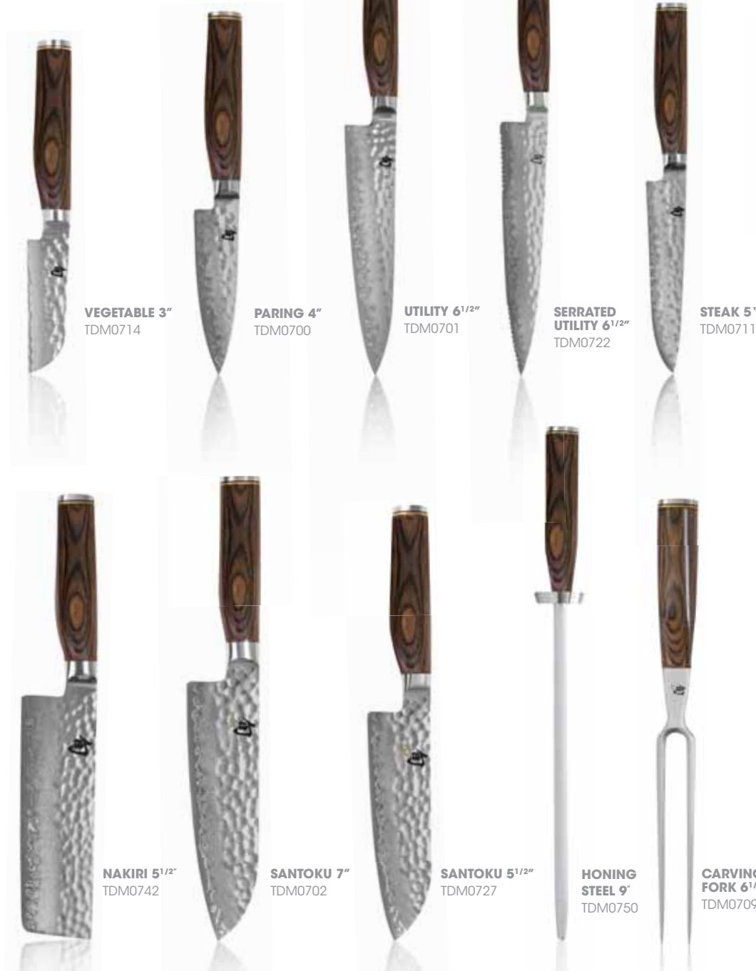
VEGETABLE 3" TDM0714