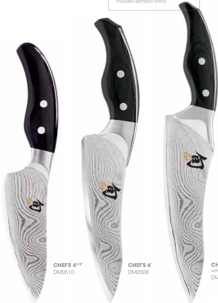
CHEF'S 4 1/2" DM0510