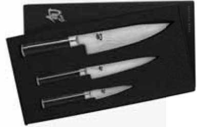
CLASSIC 3 PC STARTER SET DMS300 | Paring 3 1/2", Utility 6", Chef's 8" in a gift boxed set