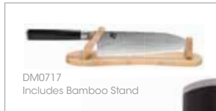
DM0717 Includes Bamboo Stand

VG10 cutting core (60 - 62 Rockwell Hardness Scale) Pattern Damascus clad with 16 layers of SUS410/SUS431 stainless each side 16° convex ground "extreme edges" D-shaped PakkaWood® handles Widest variety of classic and innovative blade shapes available