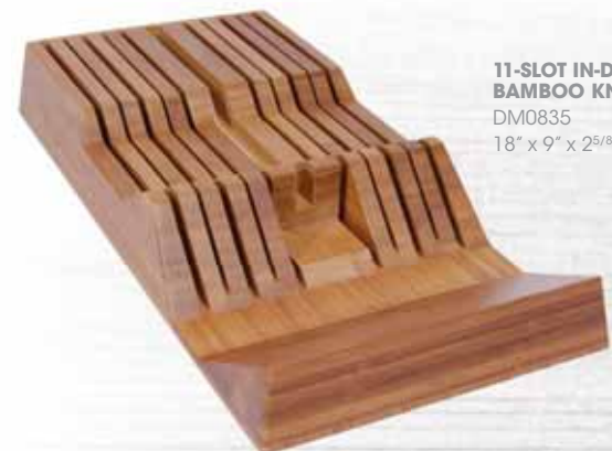
11-SLOT IN-DRAWER BAMBOO KNIFE TRAY DM0835 18" x 9" x 2 5/8"