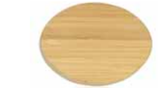
BAMBOO MAGNETIC STORAGE DISK with self-adhesive backing surface DM0803 (BULK) 3" x 2" x 5/8"