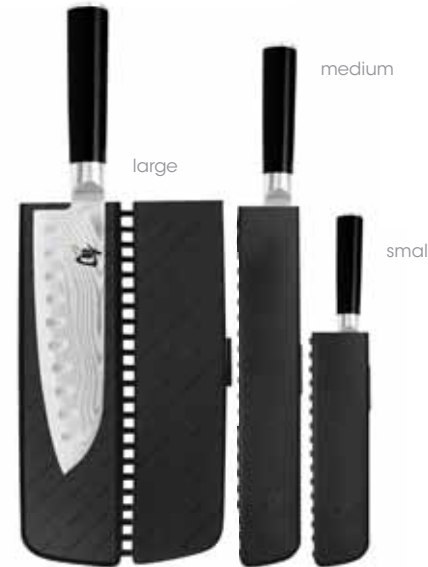
KAI MAGNETIC BLADE GUARDS Can be cut to size to customize for each knife. BG-S - small, 1 1 / 2 " x 6" BG-M - medium, 1 1 / 2 " x 10" BG-L - large, 2 1 / 2 " x 10"