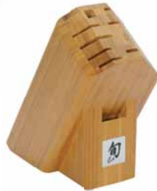
10-SLOT KEN ONION BAMBOO BLOCK DM0833