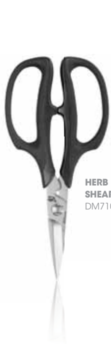
HERB SHEARS 7 1 / 2 " DM7100