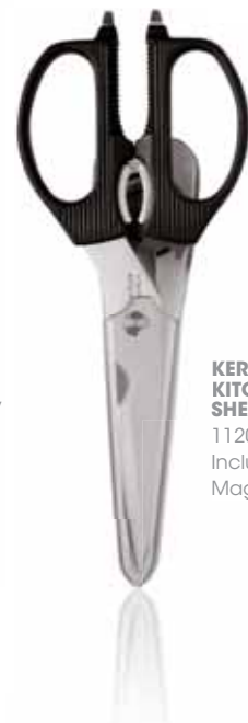
KERSHAW KITCHEN SHEARS 8 1 / 2 " 1120M Includes Magnetic Sheath