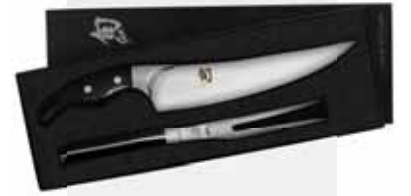
KEN ONION 2 PC CARVING SET KOS0200 | Carving Knife 8" and Carving Fork 6" in a boxed set