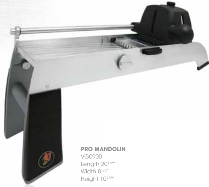
PRO MANDOLIN VG0900 Length 20 1 / 2 " Width 8 1 / 2 " Height 10 1 / 2 "