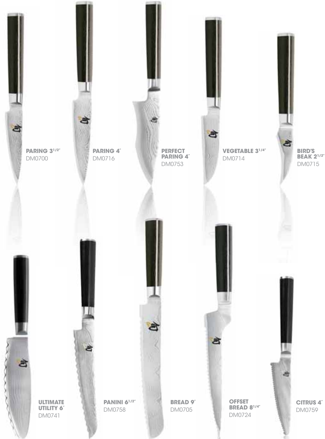
PARING 3 1/2" DM0700