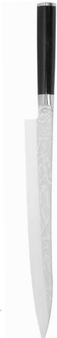
YANAGIBA 10 1/2" VG0006