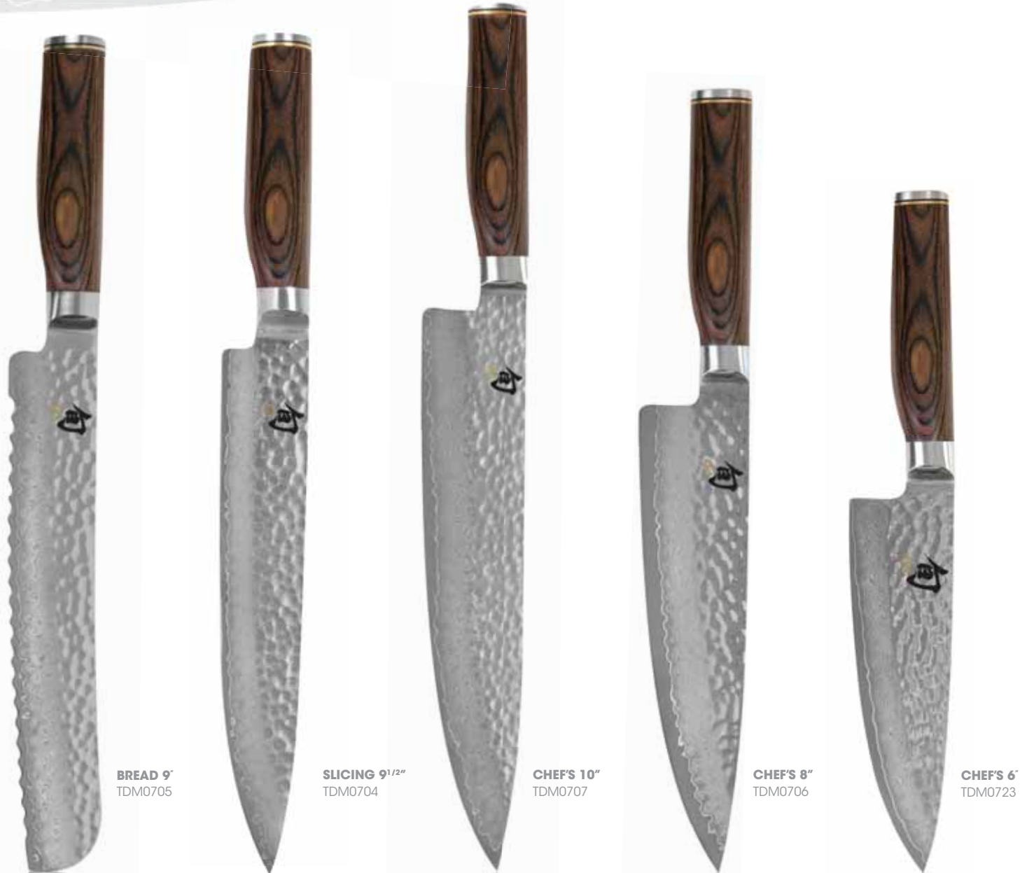
BREAD 9" TDM0705

VG10 cutting core (60 - 62 Rockwell Hardness Scale) Pattern Damascus clad with 16 layers of SUS410/SUS431 stainless each side 16° convex ground "extreme edges" Oblong PakkaWood® handles Hammered finish releases food easily when cutting